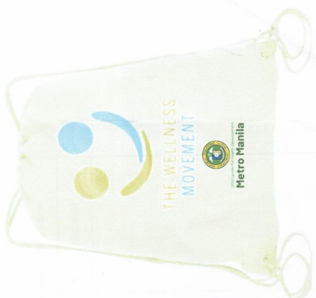
CANVAS DRAWSTRING BAG Quantity: 3000pcs Size: 8 x 10 inches Description: tote bag with logo